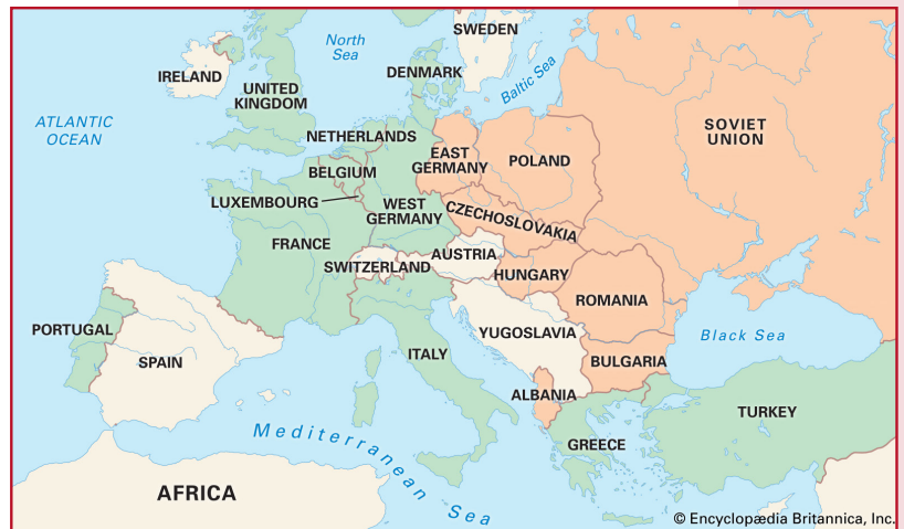
EUROPE DURING THE COLD WAR (1960) Legend: Warsaw Pact (orange), NATO (green), Non-aligned nations (yellow). Figure 2: Map of Europe during the Cold War, indicating members of NATO, The Warsaw Pact and Non-aligned states. "Warsaw Pact," Encyclopedia Britannica (Encyclopedia Britannica, inc., September 10, 2020), https://www.britannica.com/event/Warsaw-Pact .

Following the Fall of the Berlin Wall and the dismantling of the Iron Curtain in 1989, the