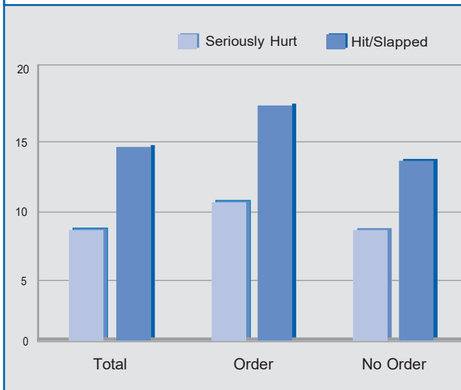
Figure 2: Percent Violent by Child Support Order

Since child support orders are most prevalent in the strictest child support enforcement states, the data presented in figure 2 suggest that there is a positive relationship between enforcement and violence. Indeed, we find that living in a state with stricter child support enforcement increases a non-cohabiting mother's risk of being hit or slapped, particularly if she reports previous abuse. In figure 3, we see that if a mother with no history of abuse lives in a state with enforcement strictness that ranks in the top 25 percent of the states in our sample (strict), her risk of being hit or slapped is over three percentage points higher than if she lived in a state with enforcement strictness than ranks in the bottom 25 percent of the states in our sample (weak). More dramatically, if she has reported prior abuse, her risk of being hit or slapped is almost three times higher (43 percent vs. 16 percent) in a 'strict' enforcement state compared to a 'weak' enforcement state. On the other hand, we observe very little difference across states in a mother's risk of being seriously hurt in a fight with the father, regardless of her history of violence