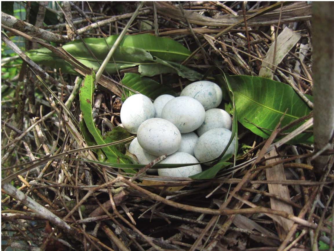
A communal nest of greater anis ( Crotophaga major) containing 10 eggs laid by three unrelated females.